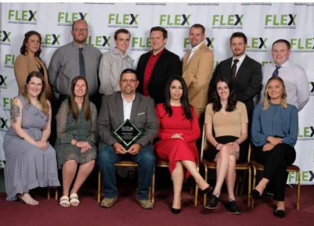
Pictured Left from 2023:

For more details on how to nominate someone check out next month's February FYI newsletter.